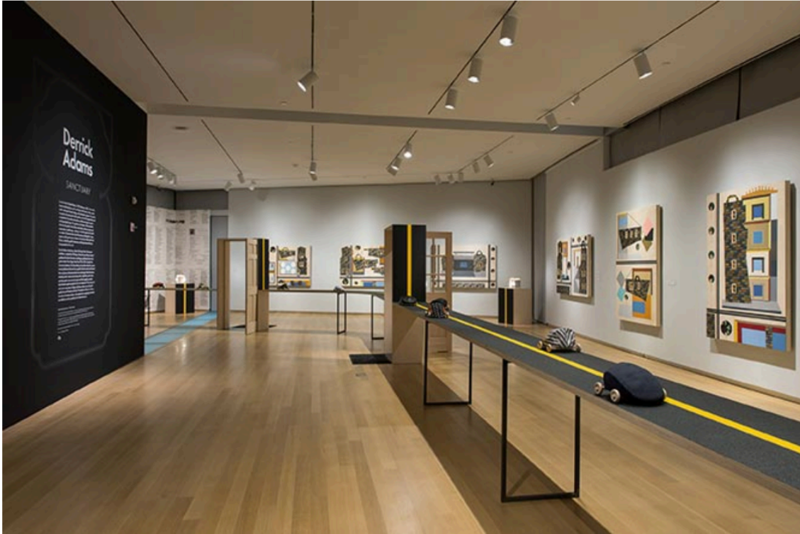
Derrick Adams, Keep Your Head Down and Your Eyes Open , 2018. Wood, acrylic paint, fabric. Variable. Installation view of Derrick Adams: Sanctuary at the Museum of Arts and Design, New York (January 25-August 12, 2018).

VISUAL ART I GALLERY 1 + 3 FEB 23—JUN 6, 2021 FREE