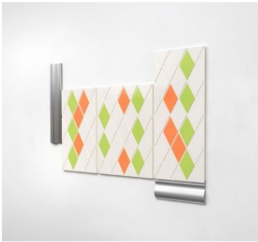
Richard Rezac, Untitled (19-11) , 2019. Painted wood, aluminum, 45 x 61-3/4 x 1-1/4 inches.

The causes are clear. Small as most of this sculptor's works are, the size of this piece is not diminutive as it falls within the viewer's normal sight lines. And even so, smaller than most paintings typically are, this relief and almost all others, draws the view close, enlarging the subtly calibrated craft for engaged perception. Rezac's choice of scale, then, brings material and technique into view as a constructed intensity embedded in planarity. Relief is sculptural compression. Here lies the force of its construct. Tension between technologies is a content of that construct, a kind of agon despite the patterning — Indeed, because of it, given that Rezac flaunts ornamentally and structurally extremes in the same . Untitled (19-11) (2019) .Why can its overt decoration of the diaper pattern seem engaged between clamps? Think of the suction cups for footpads of a gecko on a tree branch.