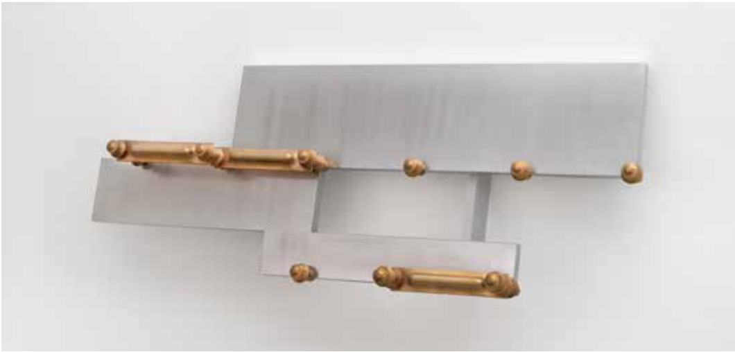
Left: Marking , 2020, cast bronze and aluminum, 15 x 37 x 9.25 inches