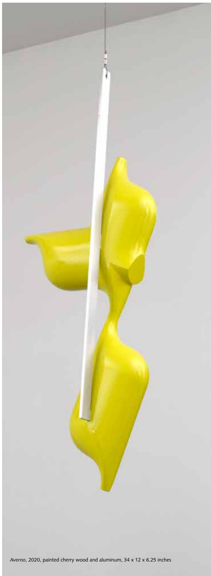
Averno , 2020, painted cherry wood and aluminum, 34 x 12 x 6.25 inches

One significant result of Rezac's discerning edits is how inevitable the finished sculptures appear. The works declare themselves in a seemingly straightforward manner but are premised on a poetic interplay of color, texture, pattern, scale, weight, and—not least—the intersection of mind and body.