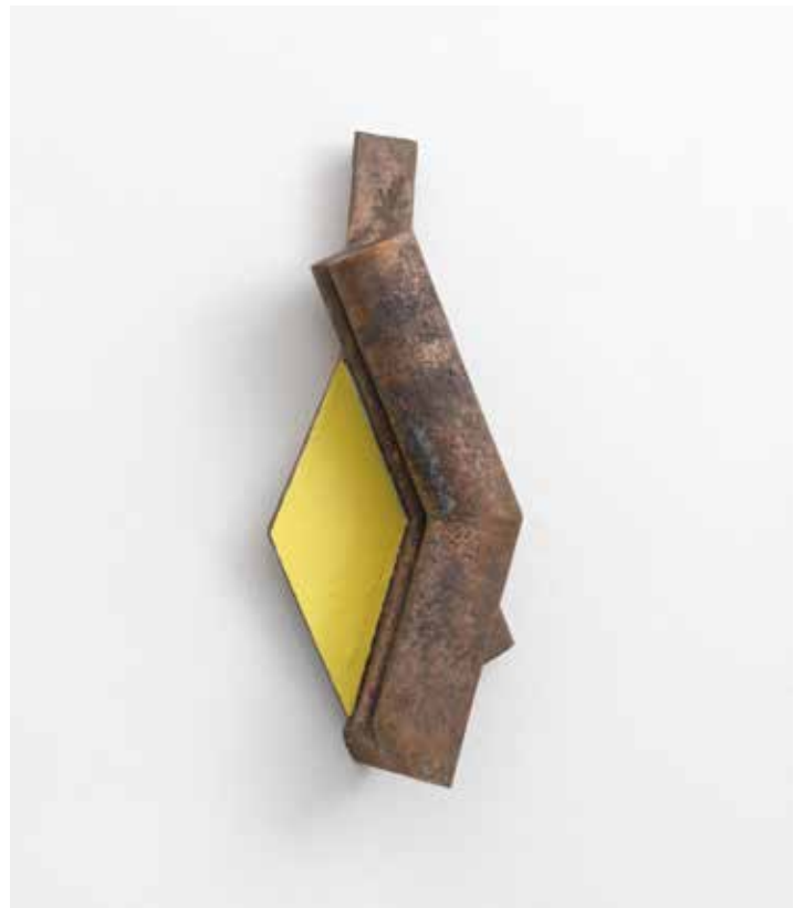
Limb (yellow) , 2020, cast bronze and oil paint. 17.25 x 7.25 x 3.25 inches