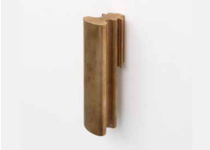
Limb (section) , 2020, cast bronze, 10.75 x 2.75 x 3.25 inches