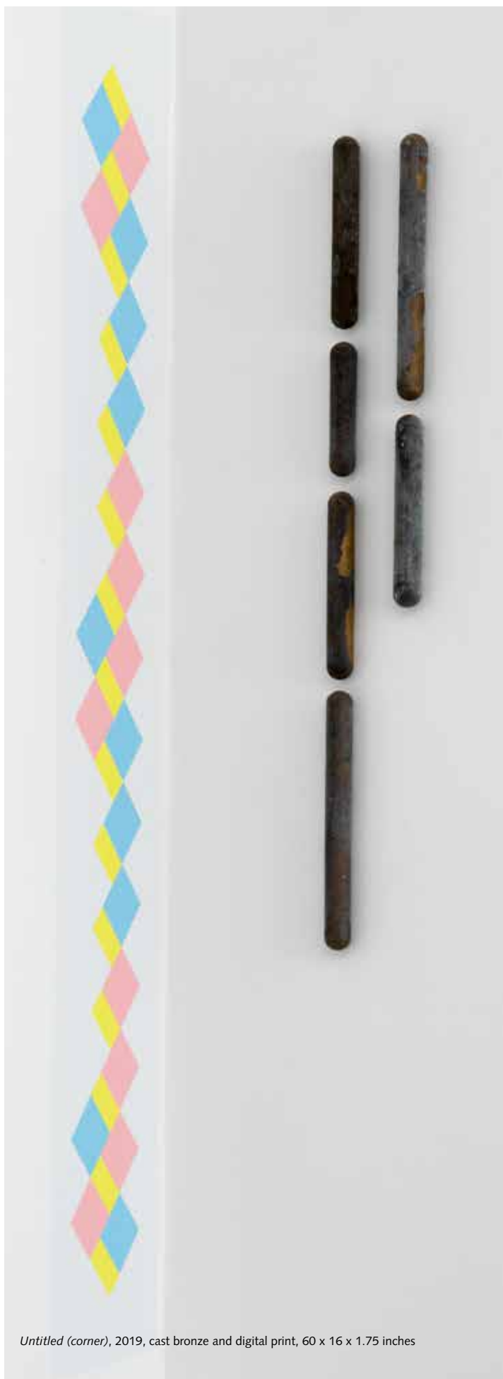
Untitled (corner) , 2019, cast bronze and digital print, 60 x 16 x 1.75 inches

Cover: Limb (harlequin dress) , 2020, cast bronze and oil paint, 12.25 x 12 x 3.25 inches